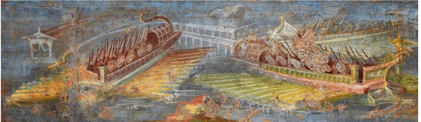
A naval fresco from Pompeii

periiit clade Campaniae; cum enim Misenensi classi praeesset et, flagrante Vesuuio, ad explorandas propius causas liburnica pertendisset, nec aduersantibus uentis remeare posset, Bui pulueris ac fauillae oppressus est, uel ut quidam existimant a seruo suo occisus, quem aestu deficiens ut necem sibi maturaret orauerat. hic in libris XX milia rerum dignarum, ex lectione uoluminum circa duum milium, complexus est; primus autem liber, quasi index XXXVI librorum sequentium, consummationem totius operis et species continet titulorum.