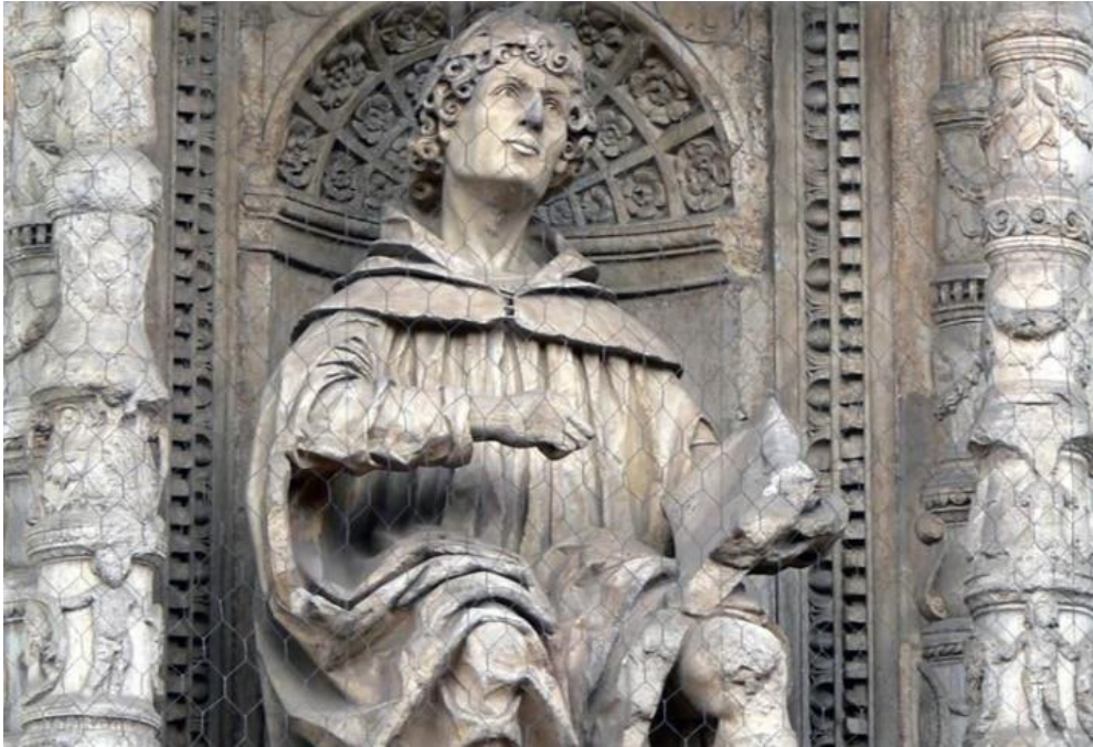
Pliny the Elder, St Maria Maggiore, Como