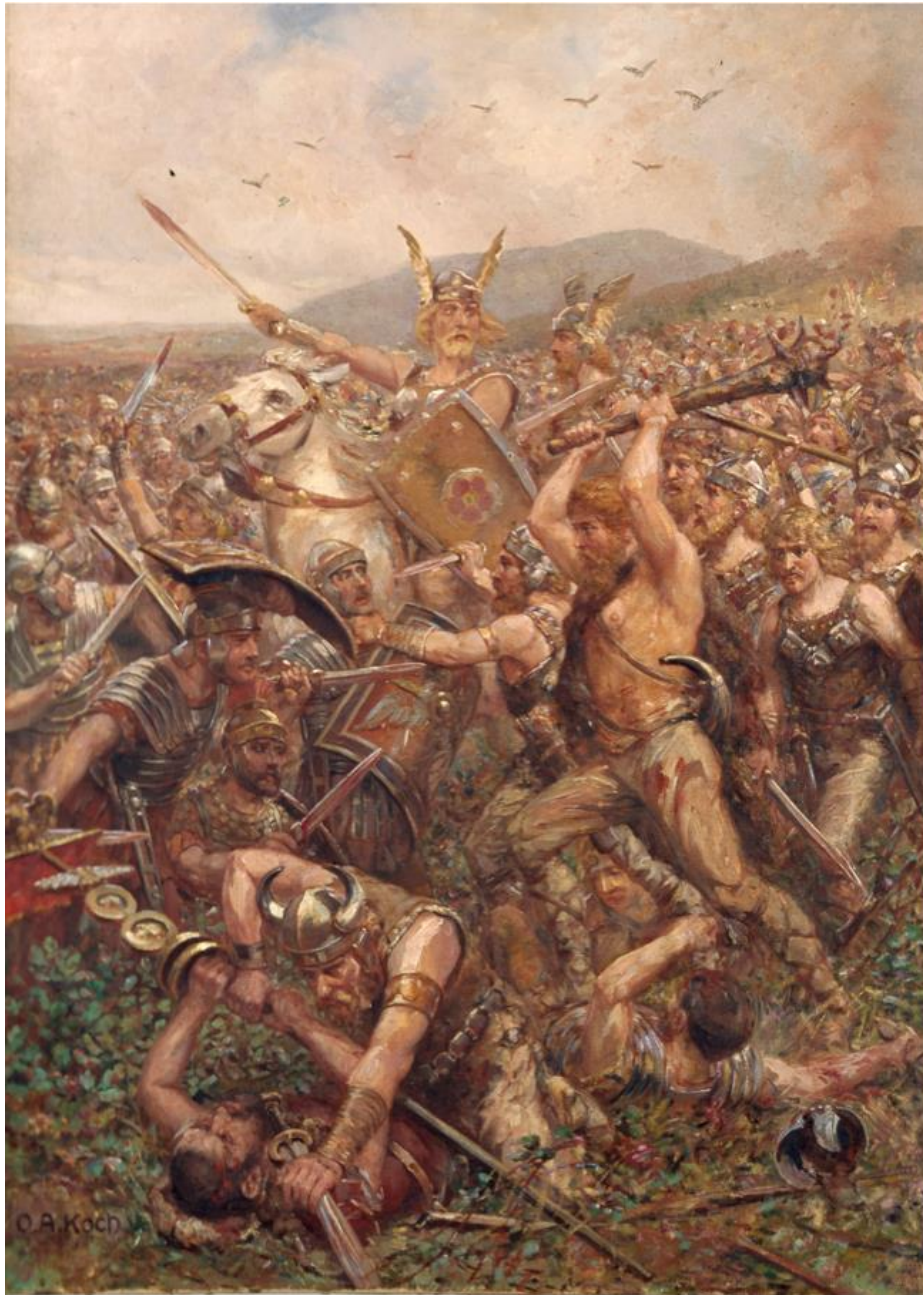
Pliny led campaigns against the Chauqi, one of the Germanic tribes that destroyed three Roman legions in the Teutoberger Forest in AD 9

Pliny took enthusiastically to the military life, serving multiple tours in Germany— Germania Inferior and Superior (under Pomponius)—from AD 46-58. During this period he met the future emperor Titus, and probably began work on his one-volume de iaculatione equestri ('On spear-throwing from horseback'), two-volume de uita Pomponii Secundi and twenty-volume Bella Germanica .