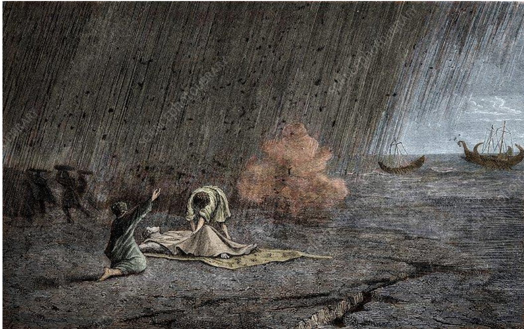
The death of Pliny the Elder

In AD 79, he was killed responding to a cry for help from his friend Rectina, caught up in the eruption of Vesuvius.