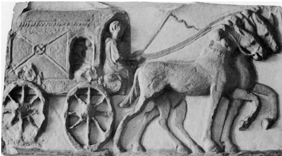
A Roman carriage

surgebat aestate a cena luce, hieme intra primam noctis, et tamquam aliqua lege cogente. 14 haec inter medios labores urbisque fremitum. in secessu, solum balinei tempus studiis eximebatur—cum dico balinei, de interioribus loquor; nam dum destringitur tergiturque, audiebat aliquid aut dictabat. 15 in itinere, quasi solutus ceteris curis, huic uni uacabat: ad latus notarius cum libro et pugillaribus, cuius manus hieme manicis muniebantur, ut ne caeli quidem asperitas ullum studii tempus eriperet; qua ex causa Romae quoque sella uehebatur. 16 repeto me correptum ab eo, cur ambularem: 'poteras' inquit 'has horas non perdere'; nam perire omne tempus arbitrabatur, quod studiis non impenderetur. 17 hac intentione tot ista uolumina peregit, electorumque commentarios centum sexaginta mihi reliquit, opisthographos quidem et minutissimis scriptos; qua ratione multiplicatur hic numerus.